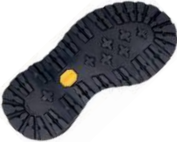
Deep lug style Vibram sole.