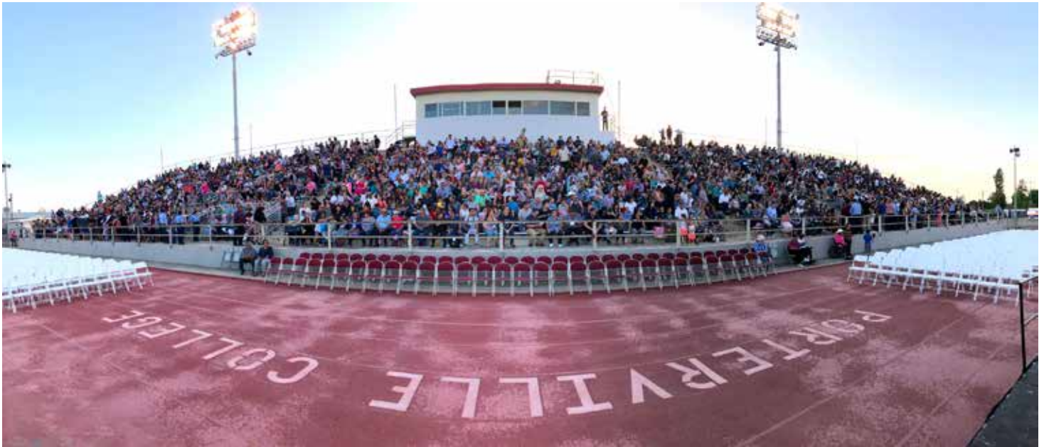
A jam-packed Jamison Stadium was ready to greet its graduates.