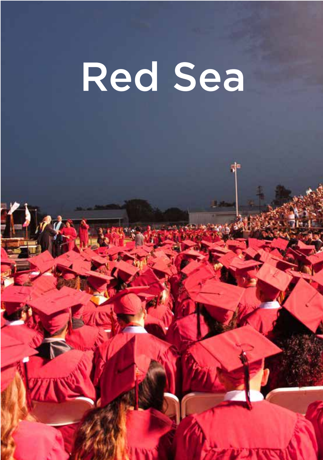
Members of the PC class of 2018 patiently wait for their names to be called.