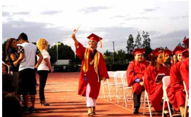
A graduate waves to her family and friends.