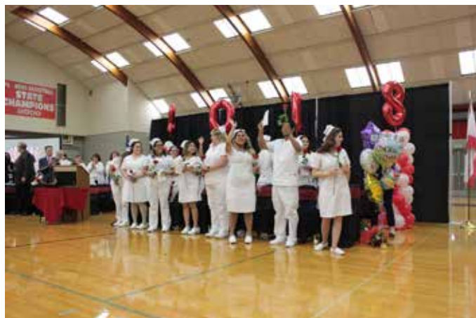
The students wave to their family and friends.

A special ceremony was held Thursday night, May 10, in the Porterville College gym for 19 students who just completed PC's nursing program, each of them earning an associate in science degree in nursing and receiving a nursing pin symbolizing their transition from student nurse to professional nurse.