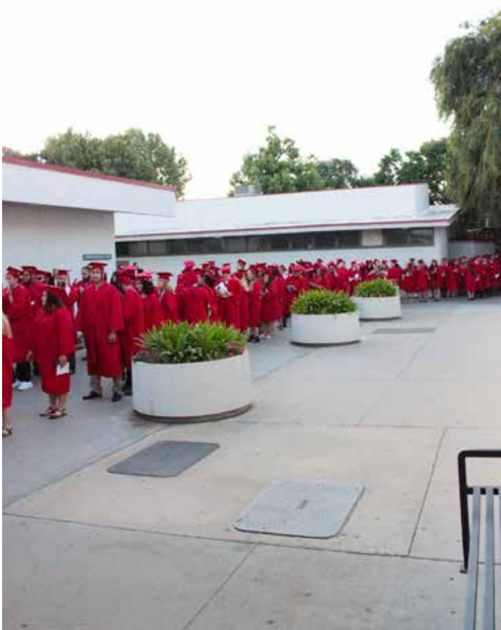
Members of the PC class of 2018 prepare to make their way over to Jamison Stadium, where an estimated crowd of 4,000 was waiting for them.