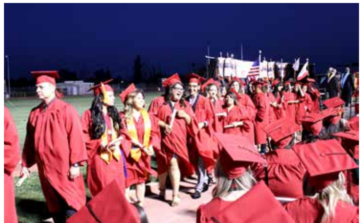
The graduates were all smiles after receiving their diplomas.