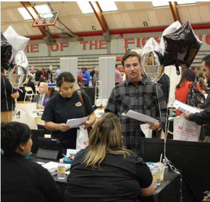
Job seekers speak with an employer.

Porterville College hosted its sixth annual Job Fair on Wednesday, May 2, in the PC gym. Fifty-one employers from Porterville and other nearby cities and approximately 500 job seekers attended the event.