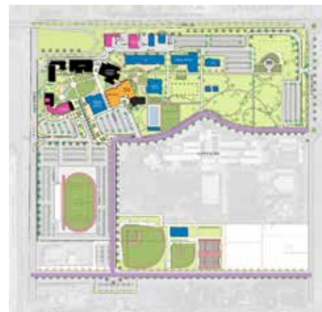
Option 2 includes rerouting College Avenue around Jamison Stadium and moving the athletic facilities to a parcel of land south of the campus.