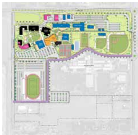
Option 1 includes rerouting College Avenue around Jamison Stadium as well as new construction within the campus' existing footprint.

After celebrating the 90th anniversary of the college last year, a new chapter is being written at PC.